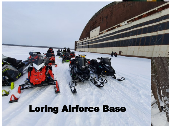
Loring Airforce Base

Go up any time you like, early and/or late. Many club members go up on Wednesday (10th) with others staying thru the 15th.