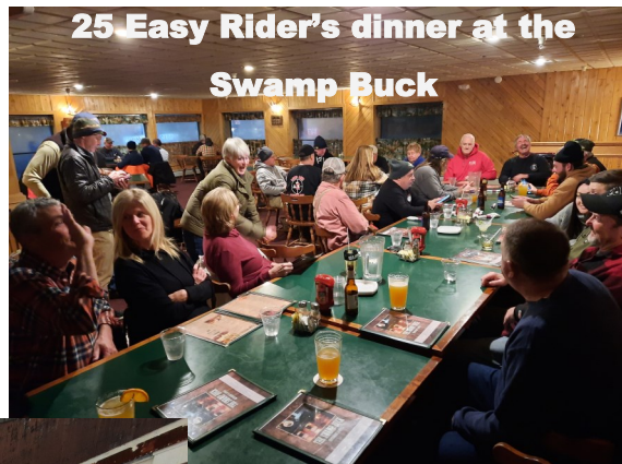
25 Easy Rider's dinner at the Swamp Buck