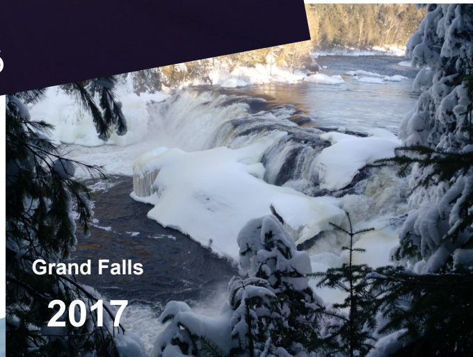
Grand Falls 2017