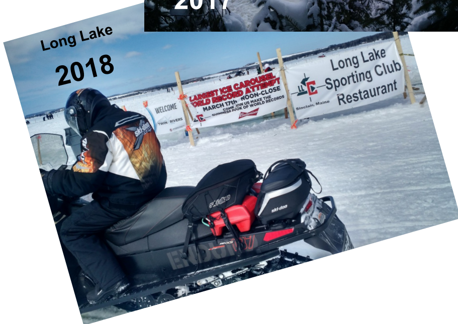
Long Lake 2018