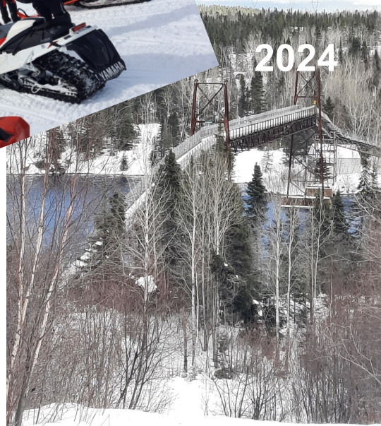
Worlds tallest snowmobile bridge North shore of the St. Lawrence