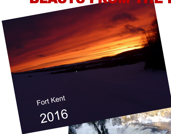
Fort Kent 2016