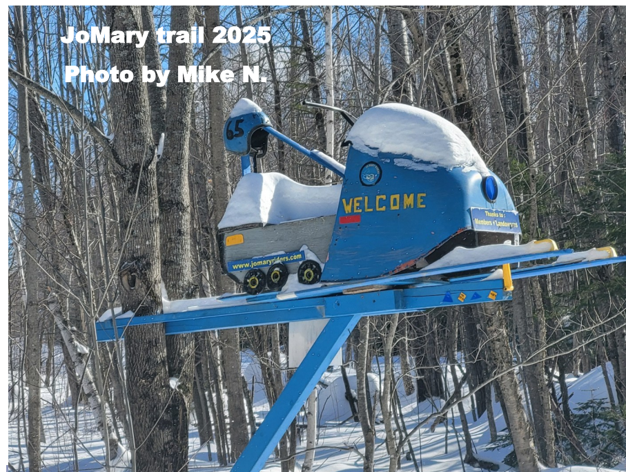
JoMary trail 2025