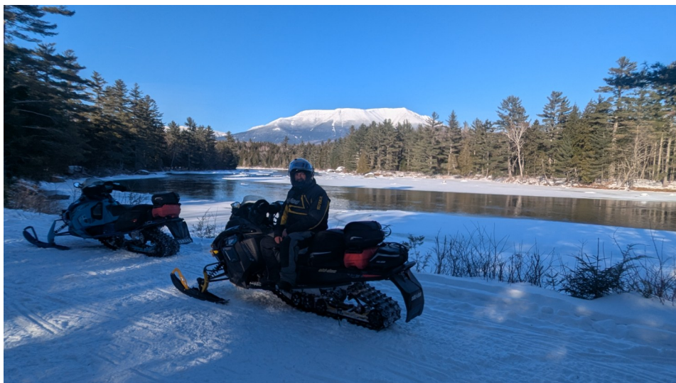
Photo op west of Millinocket with Mt. Katahdin in the background.